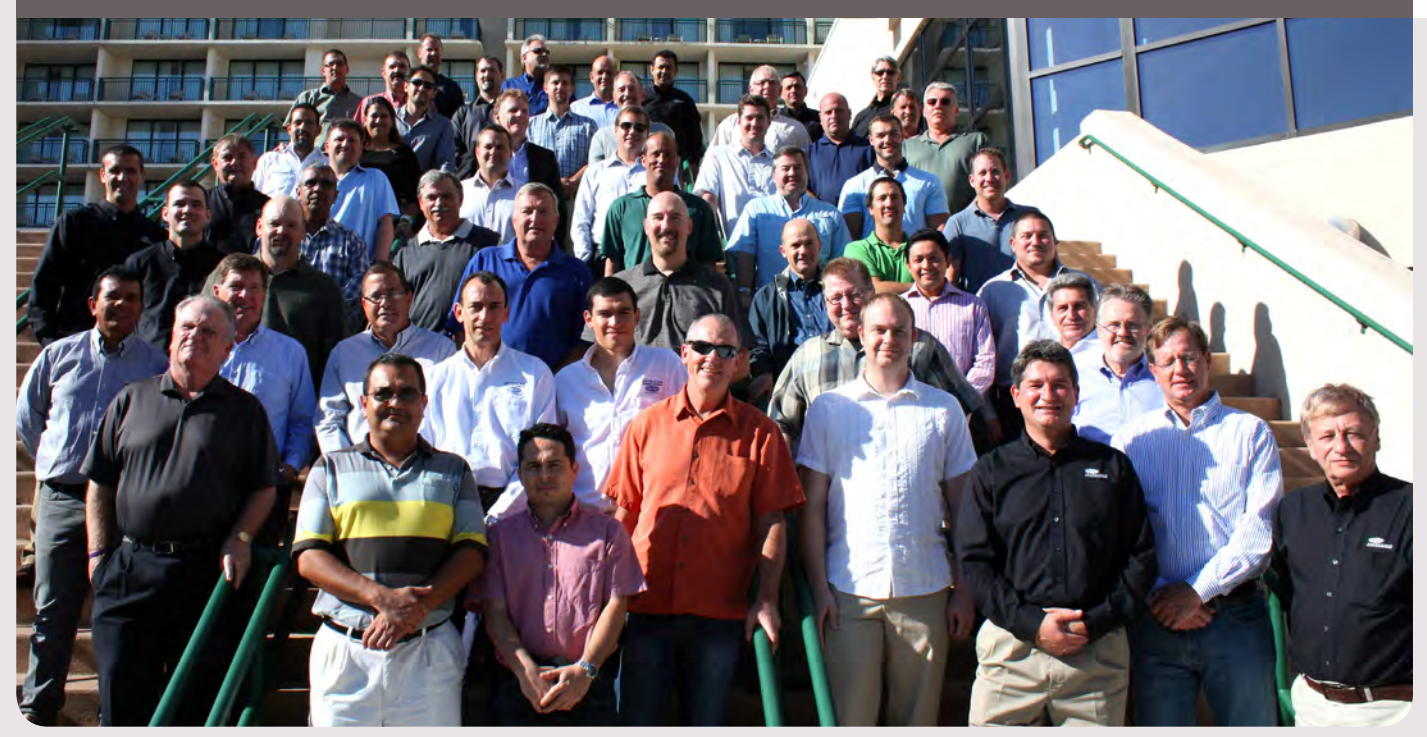
Attendees at the joint North America - Central America regional service meeting in Orlando, Fla.

The Container Products Group's longest-serving authorized service center, Transport Refrigeration Inc. of Jacksonville, Fla., received the Top Performer Award for the North America region, and Costa Rica Container Service S.A. of San Jose, Costa Rica, was recognized as the Top Performer for Central America. The awards were presented during the joint meeting of representatives of Carrier Transicold's North America and Central America service centers.