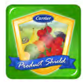
The ProductShield™ application monitors temperatures outside the trailer to manage temperature inside.

One application, called IntelliSet<sup>TM</sup>, allows a driver to choose commodity settings by name from a scrolling list in text form. Each user-configurable IntelliSet setting – customized from nearly 60 different operating parameters – can create the best balance of cooling and fuel economy for specific commodities or to meet individual customer specifications. Among its many customization features, IntelliSet offers two tools that are especially useful for fuel savings – ProductShield<sup>TM</sup> and Range Protect.