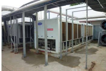
Carrier 30GX358 chillers