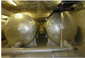
The hospital plant room with 4 storage tanks

1 control and monitoring system which manages and optimizes the cooling installation operation