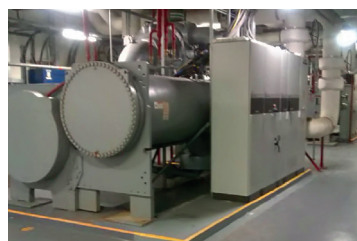
Centrifugal chiller in situ in plant room at Citi's headquarters.