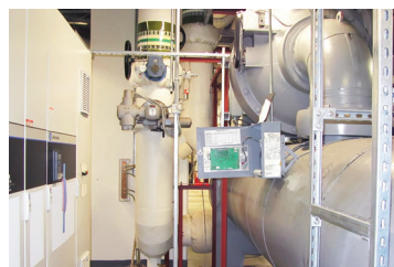
The VSD installation was delivered in sections then re-assembled in the plant room.