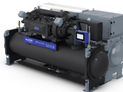
AquaEdge® Water-Cooled Centrifugal Chiller 19MV Water Cooled Chiller with LOW GWP R-134a, R-513A, R-1234ze(E) or R-515B refrigerant