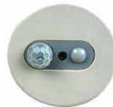
HVAC + lights/Blinds