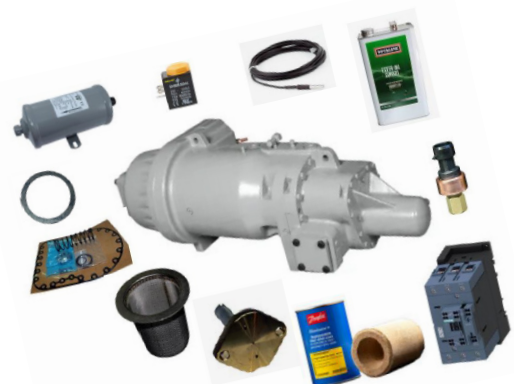
Kit for 06T compressors