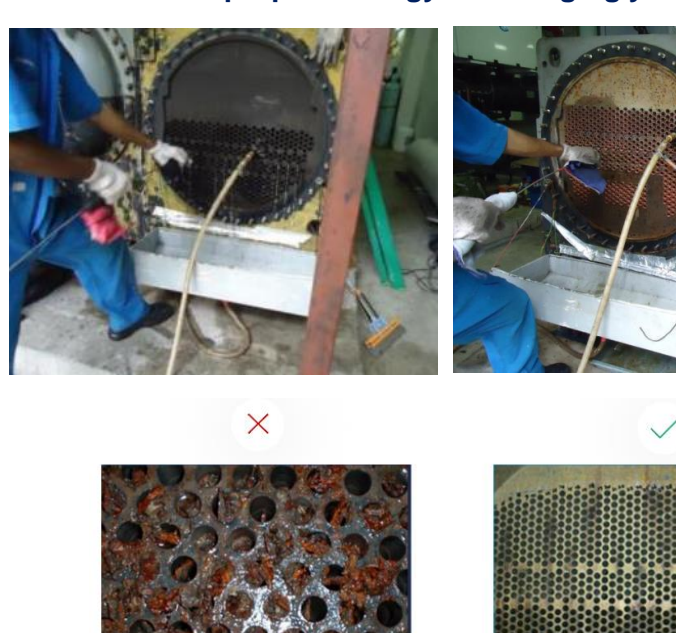
Sludge build up

Condenser Approach Temperature is an indication of heat transfer effectiveness between the refrigerant in condenser and the cooling water from cooling tower system. A high value of Condenser Approach Temperature compares to a value showing when condenser is clean, implies a poor heat transfer across the condenser tubes which is likely caused by serious fouling condition on tube surface. Negative consequences such as reduced energy efficiency of the chiller, increased pump power and increased risk of exchanger blockage may result. Keeping a close check on Condenser Approach Temperature to schedule cleaning and inspection of your condenser tubes shall be the proper strategy in managing your energy budget.