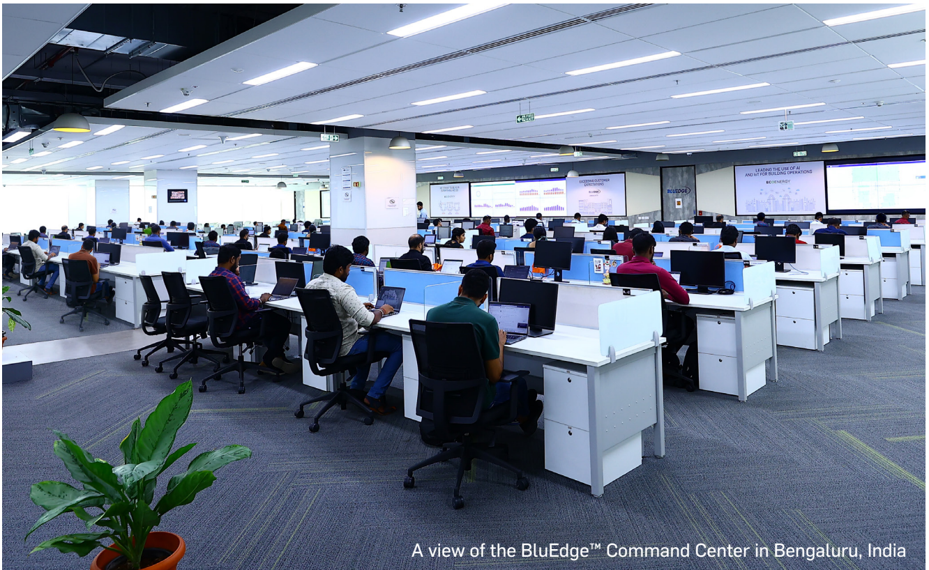
A view of the BluEdge™ Command Center in Bengaluru, India

Leverage insights on repair versus replacement opportunities for better capital budgeting and resource planning.