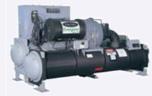
19XR Centrifugal Chiller

Through the establishment of AdvanTE 3 C solutions center, Carrier has enhanced its ability in air-conditioning system tailored to clients to offer innovative solutions including heat recovery, inverter technology, central heating, energy storage, water source heat pump systems, air terminal and other technologies, which will better address the special needs of clients with strong support for sustainable building performance.