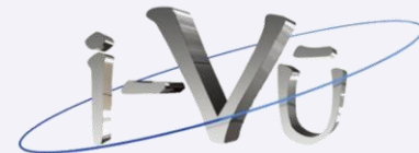
Carrier Control Network