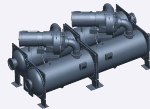
19XRD Centrifugal Chiller