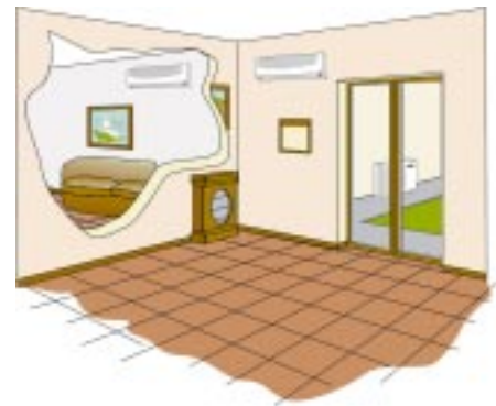
A single unit located outside can provide air-conditioning for two rooms.

alternatives. The Hybrid DC Inverter achieves this by using a clever combination of functions - Pulse Amplitude Modulation (PAM) and Pulse Width Modulation (PWM). PAM provides rapid power to reach the temperature that you have selected. PWM then maintains that temperature with maximum efficiency. In this way, the variable speed compressor delivers continuous comfort, with lower power consumption.